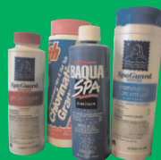
Pool & Spa Supplies