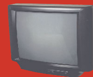
Televisions & Computer Monitors (see back for Web info)