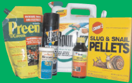
Lawn & Garden Products