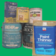
Paints, Thinners & Stains