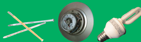
Mercury Containing Thermometers, Thermostats, Fluorescent Tubes and Bulbs