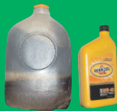
Contaminated & Unused Motor Oil